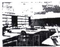
Fig.3 Classroom at UNISINOS