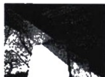
Fig.2 Circulation space at UNISINOS

Figs 2 and 3 show the places where the sensors were installed. Inside of the classroom the sensors were hung 20cm below the ceiling, at the geometric centre of the room. In the circulation space the sensors were positioned on the top of a pillar in front of the classroom in a shaded place. In the afternoon and night of one day (31/8) 40 questionnaires were applied to identify the acceptance of the thermal atmosphere in the classroom. The questionnaire registered the activity (metabolic rate), the insulation level of the clothing and the students vote of thermal acceptance of in the classroom.