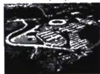
Fig.1 Universidade do Vale do Rio dos Sinos

The UNISINOS occupies an area of approximately 90 ha, in the county of São Leopoldo, at some 35 km distance from Porto Alegre, the capital of the southern state of Brazil.