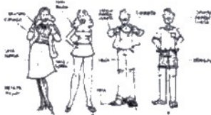
Fig.5 Questionnaire - Clothing